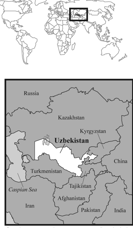
Boundary representations are not necessarily authoritative.